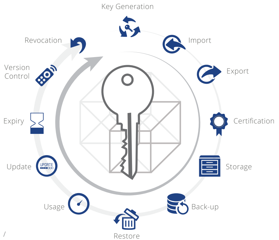
KMS manages all aspects of cryptographic keys during their life cycle

The Key Management System (KMS) uses a client-server based architecture, with shared HSMS, to provide a centralised key management solution. The system is accessed by operators using desktop computers equipped with secure PIN pads for key component entry. An extremely flexible 'key-push' protocol allows the KMS server to securely connect with practically any secure host system that supports exchange of cryptographic keys.